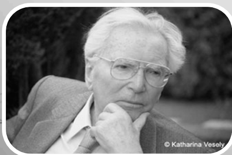
Professor Viktor E. Frankl